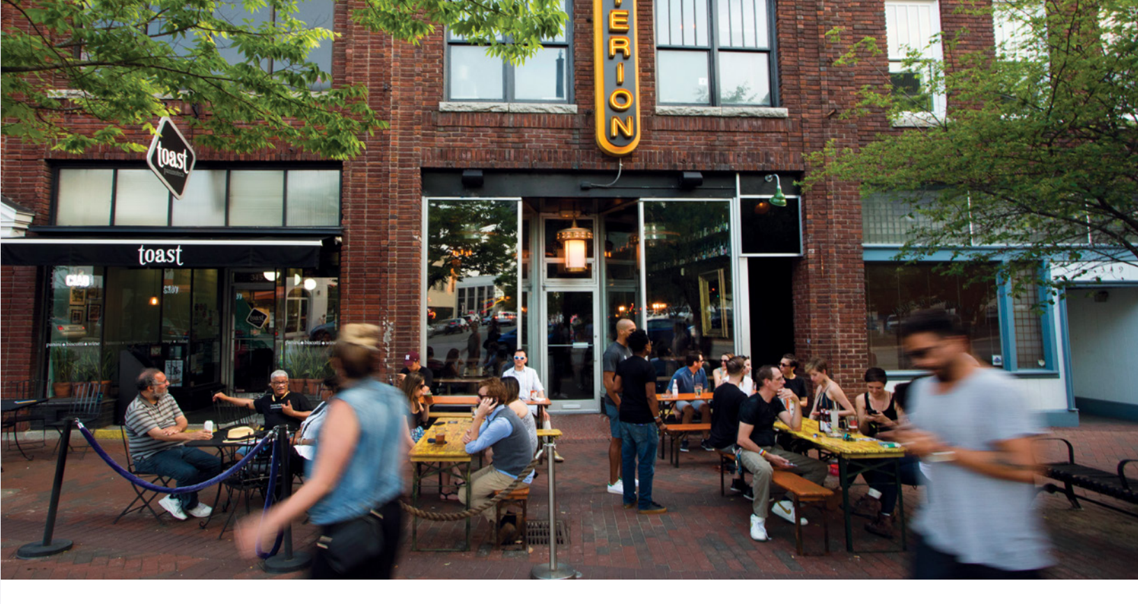
Top: Enjoy a stroll in Five Points amongst a unique blend of businesses, dining and retail. Middle: One of the most famous baseball teams in the world, the Durham Bulls drew 500,000 fans to downtown in 2016. Bottom: Enjoy the outdoors in Durham Central Park, home to a lively farmer's market community every weekend.