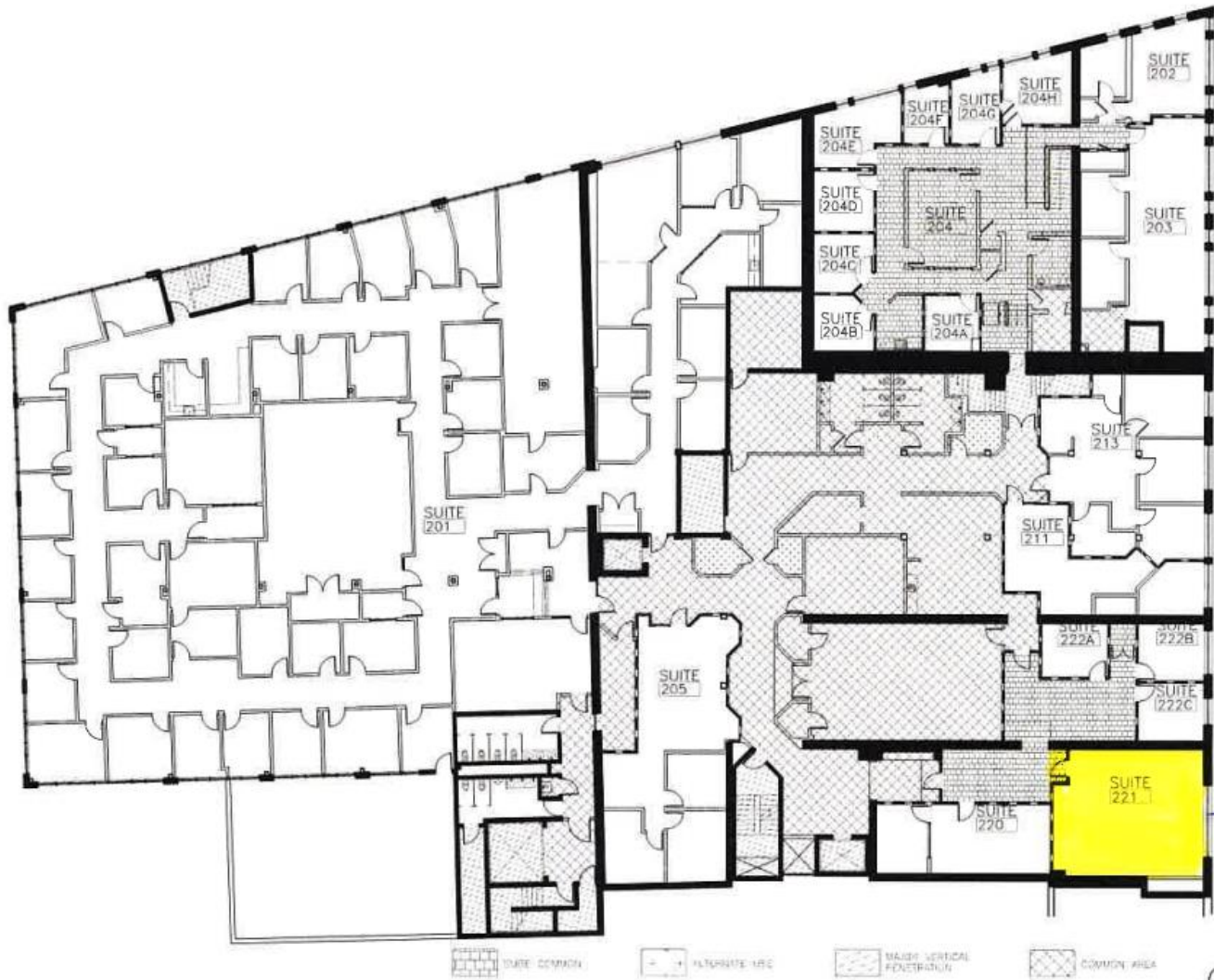
1 SECOND FLOOR PLAN 1" = 20'-0"